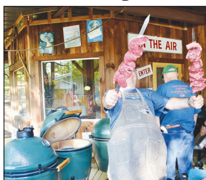
The Ninth Annual Georgia Mountain Eggfest was a smashing success at the Georgia Mountain Fairgrounds over the weekend.